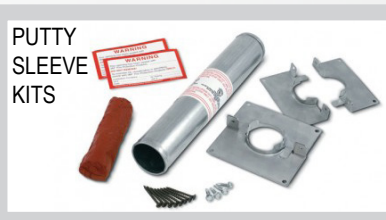
PUTTY SLEEVE KITS